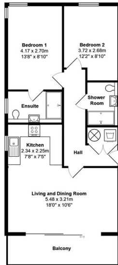
19 Fen View

Total Area: 62.0 m 2 ... 667 ft 2 (excluding balcony)