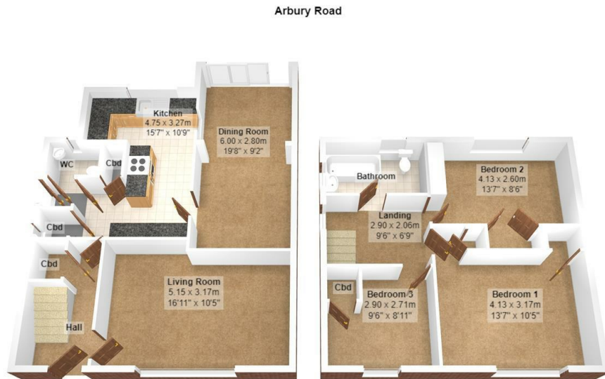
Total Area: 107.2 m 2 ... 1154 ft 2 All measurements are approximate and for display purposes only